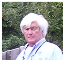
By Trent Pridemore