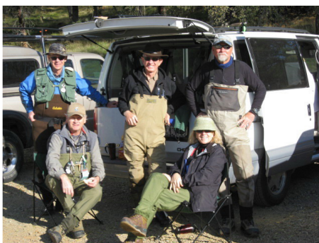
Lower Yuba Fishout Attendees

As I write this we are entering Christmas week with some rain and snow mix. The forecast is good with rain expected all week. Unless we get huge downpours melting the snow pack, moderate rain should help Squirrel and Deer creek color the river. Give aquatic worms, (aka San Juan worms) a try.