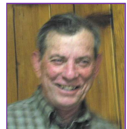
By Sam Higginbotham

Hook Daiichi 1710 1X or 2X long heavy wire Abdomen natural grayish Australian opossum or Buggy nymph dubbing #16 Thread tan 8/0 or 6/0 Wing dark elk hair Weight lead wire (optional) Head amber goat dubbing Tail mallard or teal-flank natural bronze or dyed bronze Hackle mallard or teal flank-feather fiber bronze Rib small copper wire