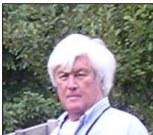
By Trent Pridemore