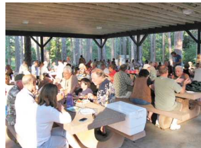
GCFF Aug 3rd BBQ Attendees