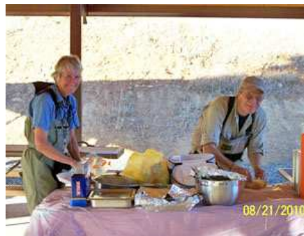
Lunch at the USD Site Pavilion