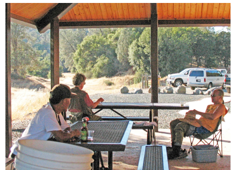
The lunch was sure good!