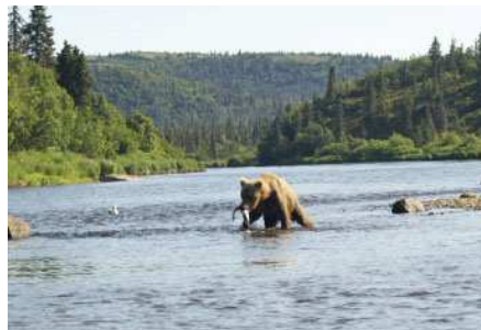
Ralph Wood sent this picture of a Copper River Brown Bear feeding on Salmon