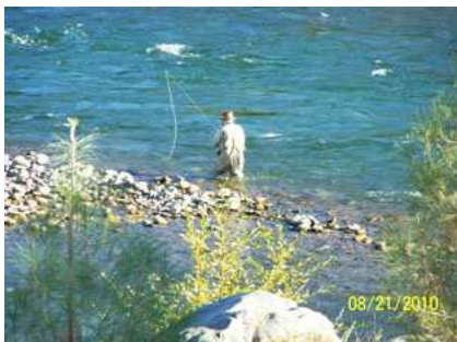
Lower Yuba Fly Fishing is a challenge