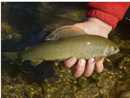
Ralph Wood's Grayling, from the Gibraltar River, Lake Iliamna, Alaska