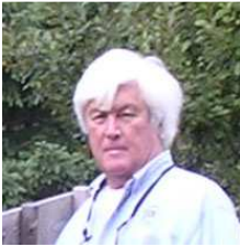
By Trent Pridemore