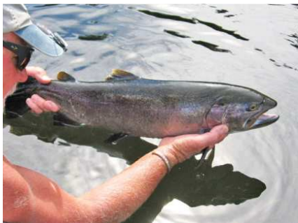
Let's have a Fishout at Klamath Lake!