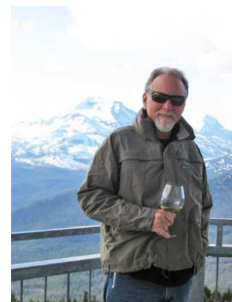
...finally gives up and turns to drinking after being out-fished by his wife!