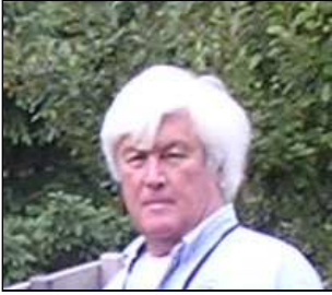
By Trent Pridemore