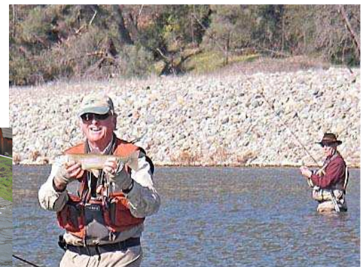
It's really fun when you catch a good one right under the coach's nose!