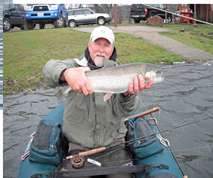
Our President apparently doesn't catch small fish