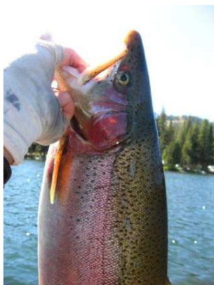
This is what it's all about!